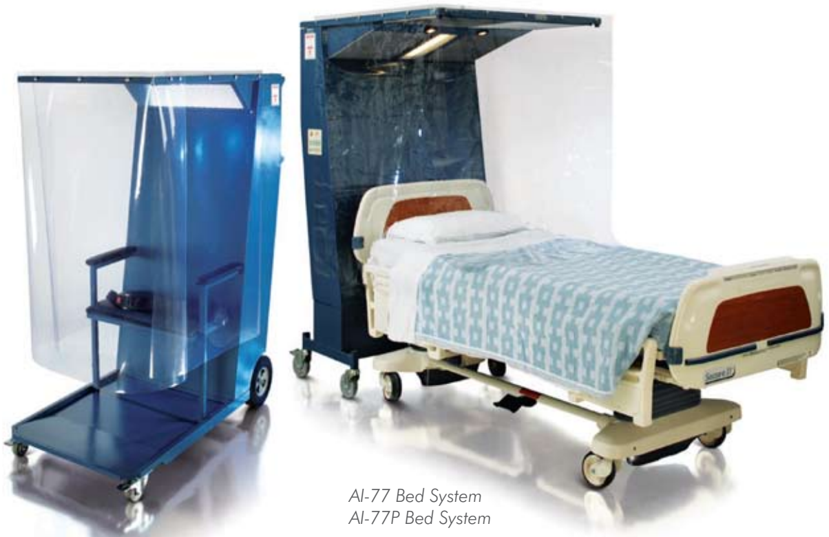
AI-O7 Transporter System AI-O7P Transporter System

The portable Positive Pressure Protective Isolation Systems (AI-O7P Transporter System and AI-77P Bed System) offer positive pressure "protective isolation" that exceeds CDC guidelines to isolate or transport patients that need protection from the environment. Applications include Immunosuppressed Patients, Burn Patients, Bone Marrow Transplant Patients and ICU Patients.