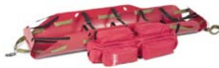
Vertical Rescue MS36VLR

Med Sled has significant advantages and benefits over the SKED Sled!