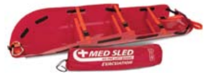
Patient Transport MS36