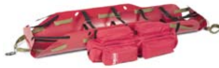
Vertical Rescue MS36VLR