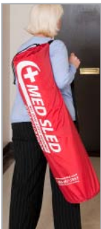
Each Med Sled Comes With Its Own Carrying Bag With an Over-the-Shoulder Strap