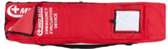
Med sled Is Easy To Store! (4 Sled Storage Wall Unit)

Med Sled Can Help Safely Evacuate All Size Patients!