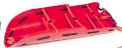
Bariatric Med Sled