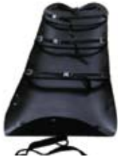
Tactical/Hostile Extrication MS30

Tactical Evacuation • Vertical Evacuation • Patient Transport