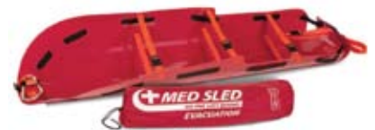
Patient Transport MS36