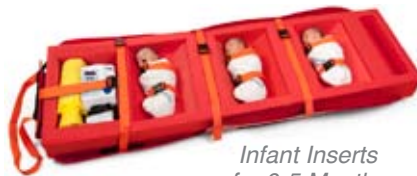
Infant Inserts for 0-5 Months

Med Sled Can Help Safely Evacuate All Size Patients!