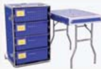
Medical Case, 4 Drawer/Table