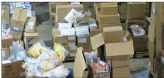
Disorganized Medical Assets

Transform disorganized medical equipment and supplies into a Response-Friendly™ System!