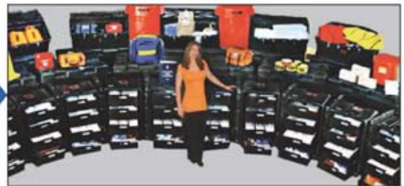
Response-Friendly™ Medical System