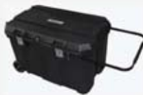
Mobile Medical Case