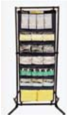
Upright Medical Organizer & Stand