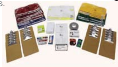
Support Module for HICS (SM-HICS)