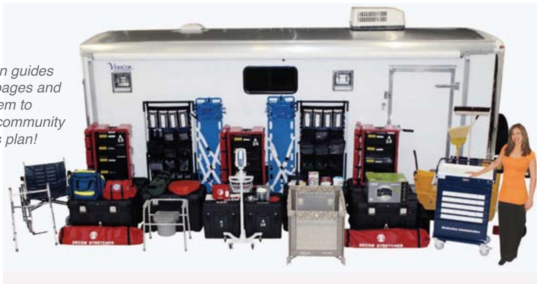
Casing Solutions Used In Patient Surge Modules

Use the selection guides on the following pages and create a system to compliment your community preparedness plan!