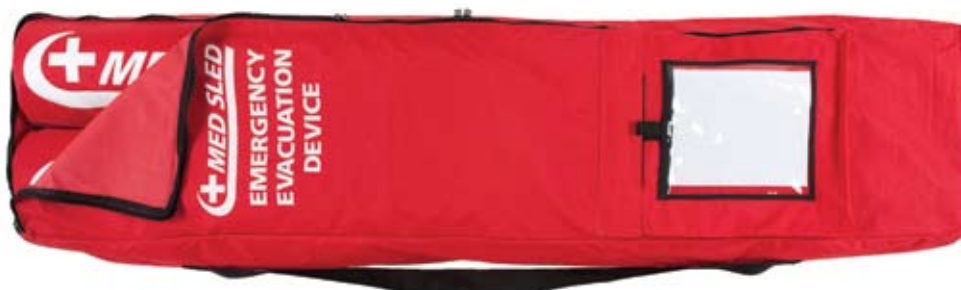
Med sled Is Easy To Store! (4 Sled Storage Wall Unit)

Med Sled Can Help Safely Evacuate All Size Patients!