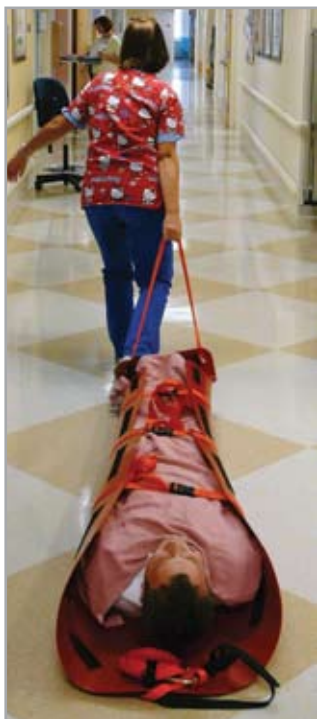
Staff Can Easily Transport Patients 2 to 3 Times Their Own Weight!

Med Sled is a cost efficient, no-lift device. It allows emergency workers to evacuate non-ambulatory individuals down stairwells, using a tethered braking device for a controlled and smooth descent. Med Sled can easily be taken to the patient. The patient can be placed in the Med Sled in less than one minute and be evacuated to safety. Med sled is currently used in hospitals and nursing homes all over the country.