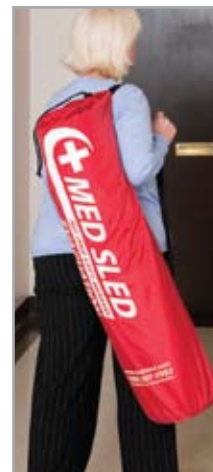
Each Med Sled Comes With Its Own Carrying Bag With an Over-the-Shoulder Strap