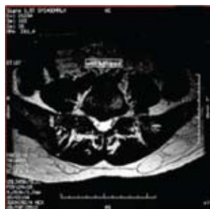
Scan with MRIPad.

In these side-by-side comparisons, you can see that there is no signal loss and no artifacting of the spine between patients with and without the MRIPad.