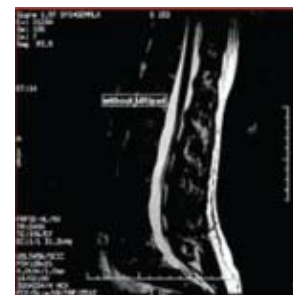
Scan without MRIPad.