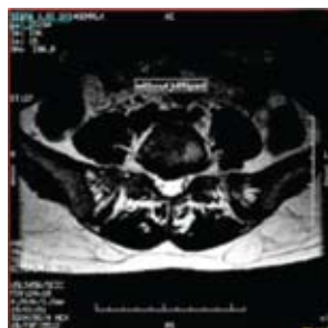
Scan without MRIPad.