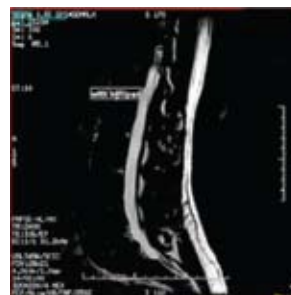
Scan with MRIPad.